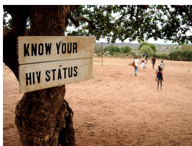
HIV testing sign in Zambia

Dr. Pierre Yassa, a member of the IUSTI-Africa core team, reports that the Government of the Republic of Zambia, through the Central Statistical Office and the Ministry of Health, National AIDS Council, and the University of Zambia, and with technical assistance from MEASURE Evaluation, recently released the findings of the 2009 national Zambia Sexual Behaviour Survey, the fifth in a series of such household surveys to monitor knowledge, attitudes, and behaviours regarding HIV/AIDS in Zambia. The main objective of the survey is to obtain national estimates of a number of key indicators important to monitoring progress of the national HIV/AIDS/STDs programme.