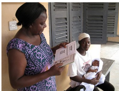
Congenital syphilis can be prevented by screening pregnant women